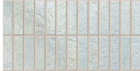
G8314 Villora Aqua 32x62.5cm / 12.6"x24.6"