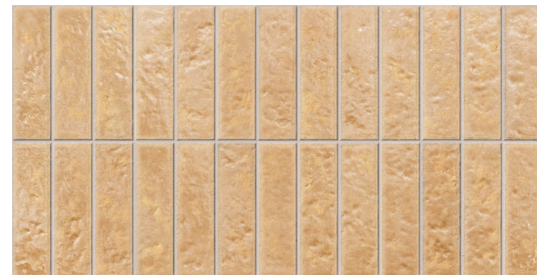
G8315 Villora Honey 32x62.5cm / 12.6"x24.6"