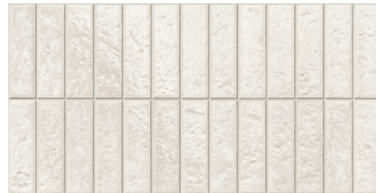
G8316 Villora Clay 32x62.5cm / 12.6"x24.6"