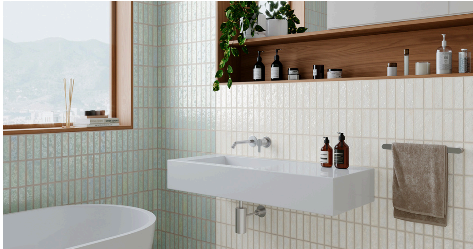
G8314 Villora Aqua 32x62.5cm / 12.6"x24.6" - G8316 Villora Clay 32x62.5cm / 12.6"x24.6"