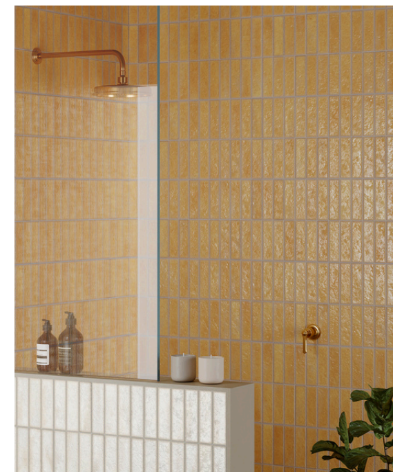
G8315 Villora Honey 32x62.5cm / 12.6"x24.6" · G8316 Villora Clay 32x62.5cm / 12.6"x24.6"