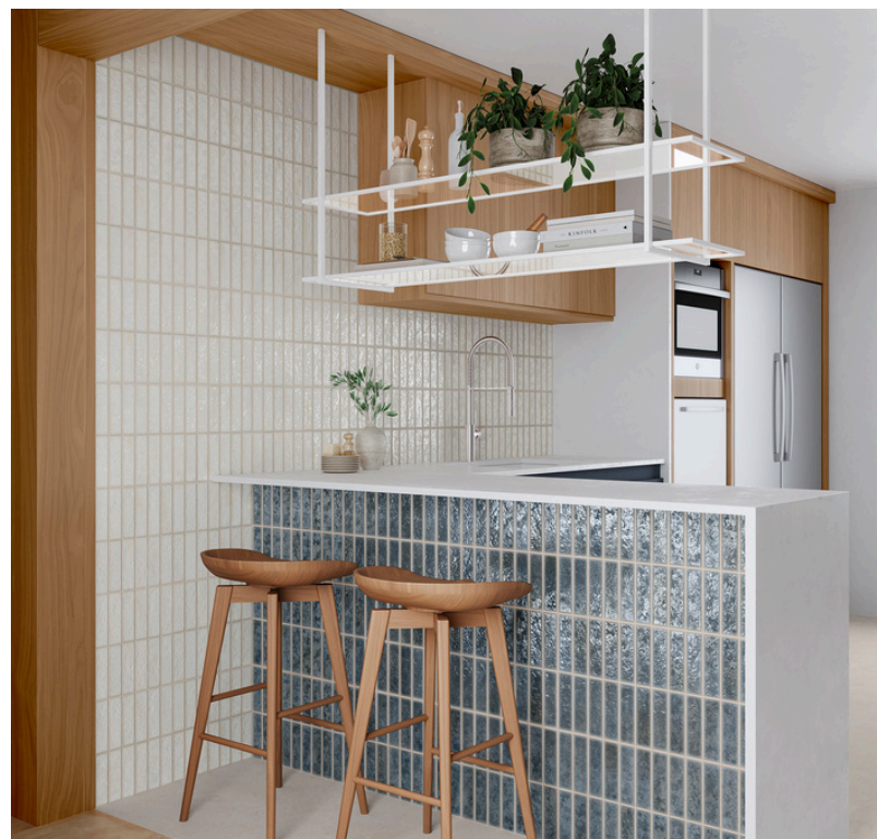
G8310 Villora Blue 32x62.5cm / 12.6"x24.6" - G8316 Villora Clay 32x62.5cm / 12.6"x24.6"