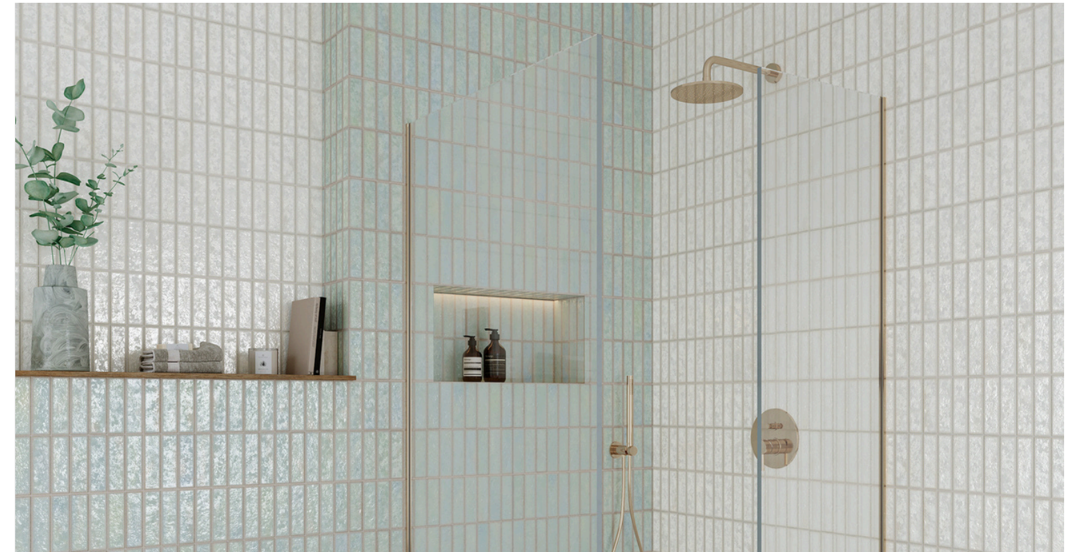
G8314 Villora Aqua 32x62.5cm / 12.6"x24.6" · G8316 Villora Clay 32x62.5cm / 12.6"x24.6"