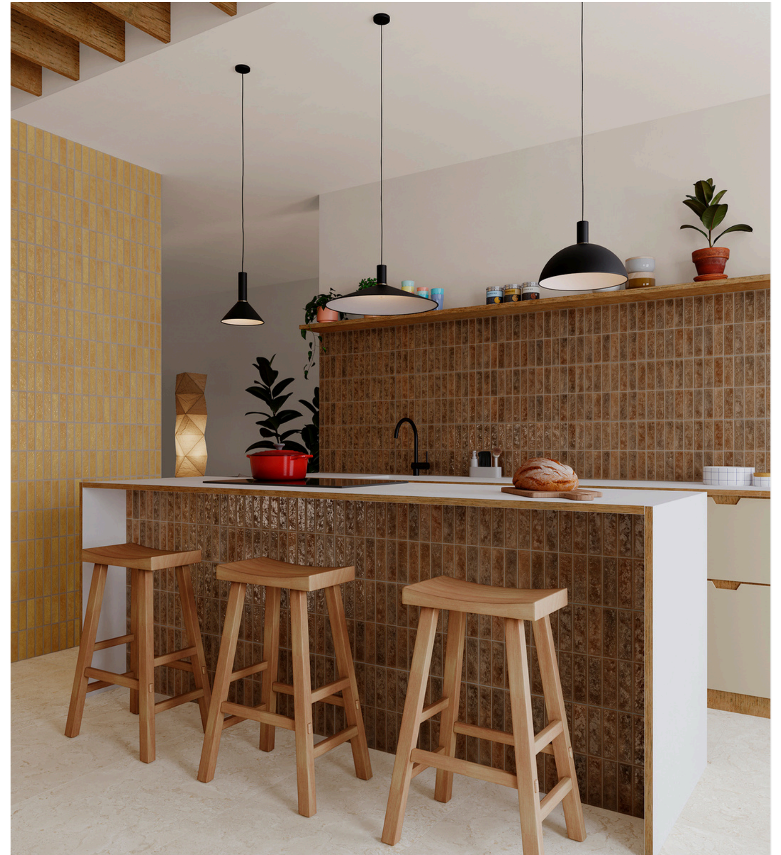
G8312 Villora Brown 32x62.5cm / 12.6"x24.6" - G8315 Villora Honey 32x62.5cm / 12.6"x24.6"