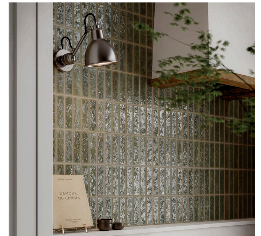
G8311 Villora Green 32x62.5cm / 12.6"x24.6"