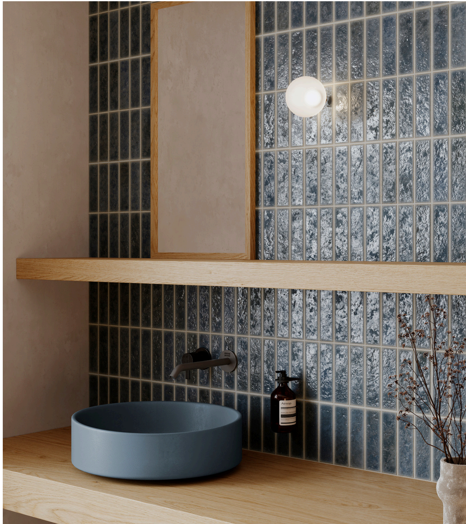
G8310 Villora Blue 32x62.5cm / 12.6"x24.6"