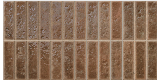
G8312 Villora Brown 32x62.5cm / 12.6"x24.6"