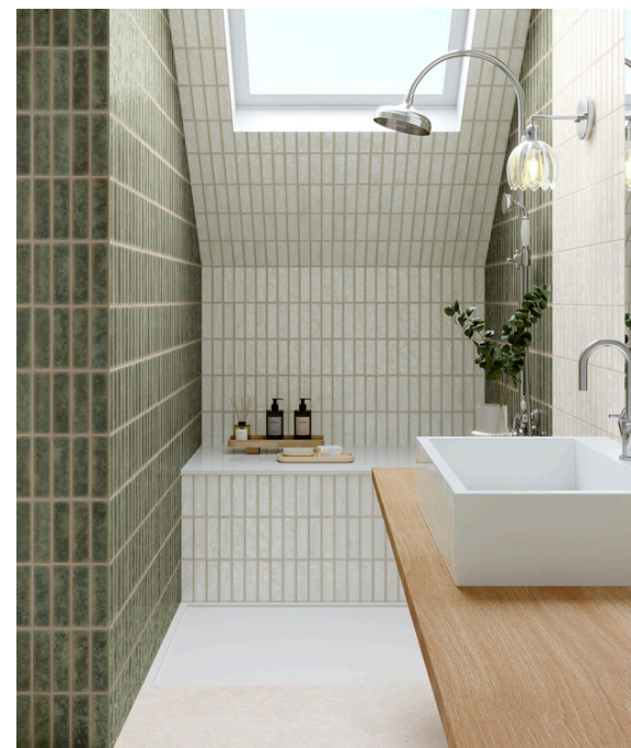
G8311 Villora Green 32x62.5cm / 12.6"x24.6" - G8316 Villora Clay 32x62.5cm / 12.6"x24.6"