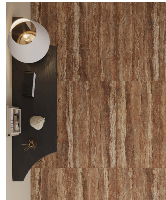
D8924 Travertine Bold Matte 60x120 / 24"x48" · D8925 Travertine Bold Chiseled 60x120 / 24"x48"