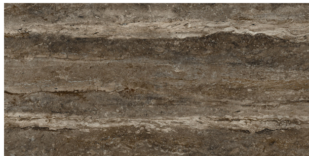
D8926 Travertine Titanium Matte 60x120 / 24"x48"