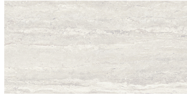
D8921 Travertine Ivory Chiseled 60x120 / 24"x48"