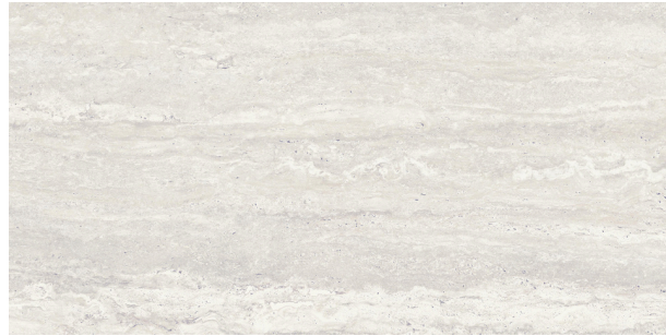
D8920 Travertine Ivory Matte 60x120 / 24"x48"