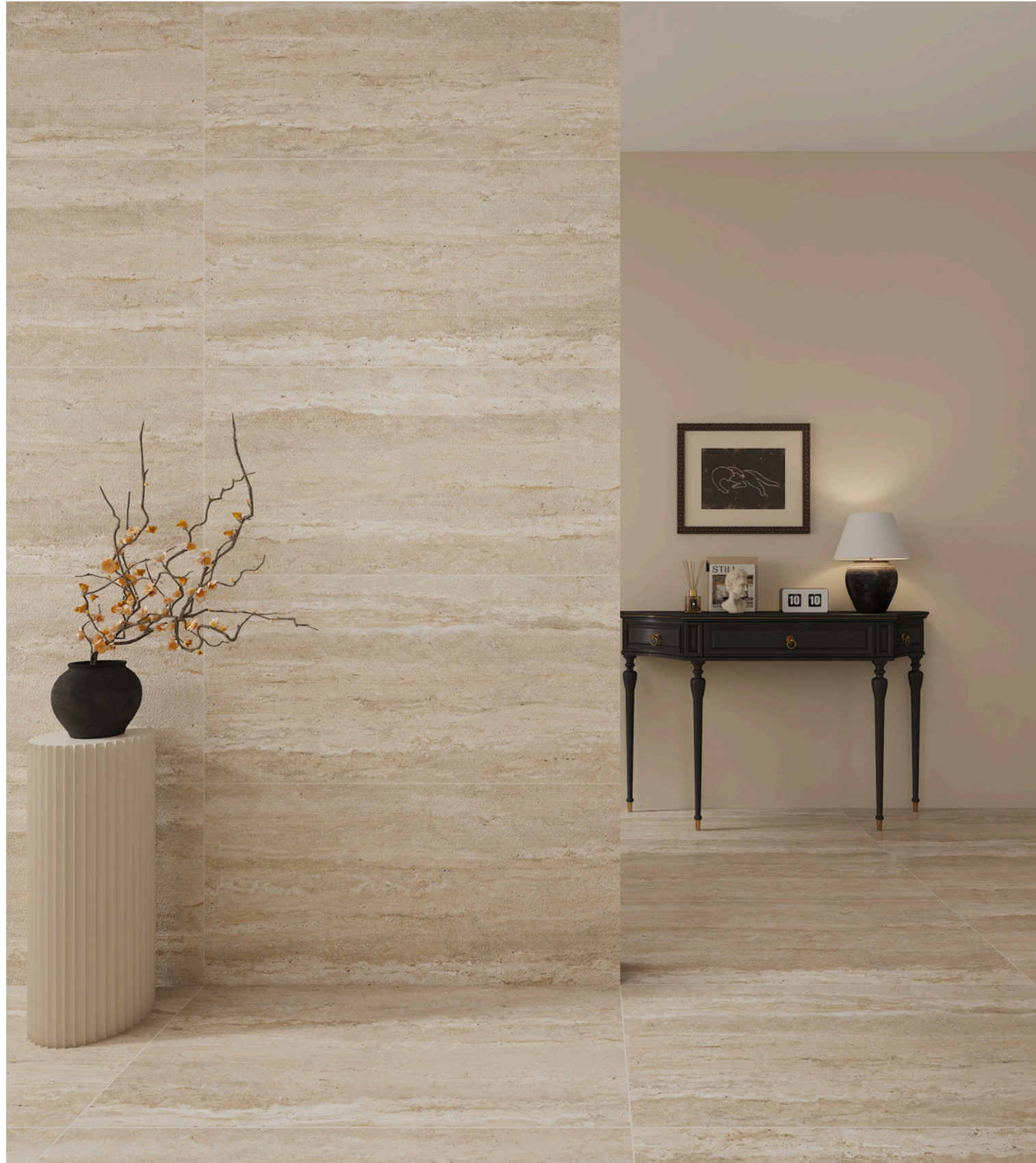
D8922 Travertine Beige Matte 60x120 / 24"x48" · D8923 Travertine Beige Chiseled 60x120 / 24"x48"