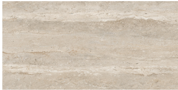
D8922 Travertine Beige Matte 60x120 / 24"x48"