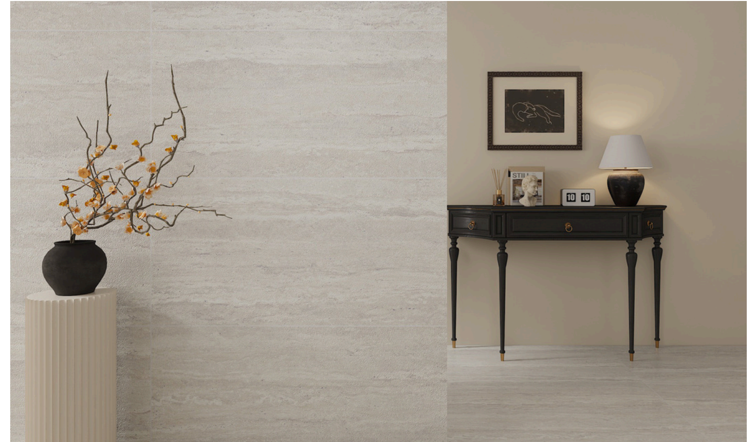
D8920 Travertine Ivory Matte 60x120 / 24"x48" · D8921 Travertine Ivory Chiseled 60x120 / 24"x48"