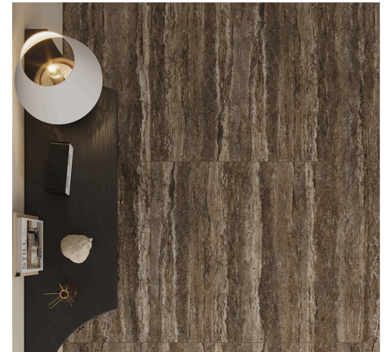
D8926 Travertine Titanium Matte 60x120 / 24"x48" · D8927 Travertine Titanium Chiseled 60x120 / 24"x48"