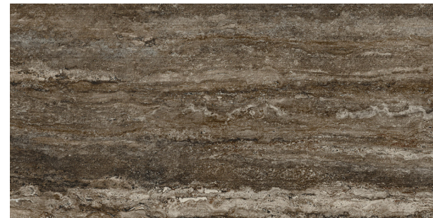
D8927 Travertine Titanium Chiseled 60x120 / 24"x48"