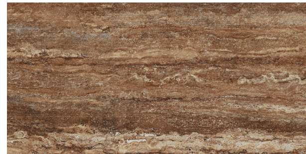
D8925 Travertine Bold Chiseled 60x120 / 24"x48"