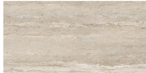
D8923 Travertine Beige Chiseled 60x120 / 24"x48"