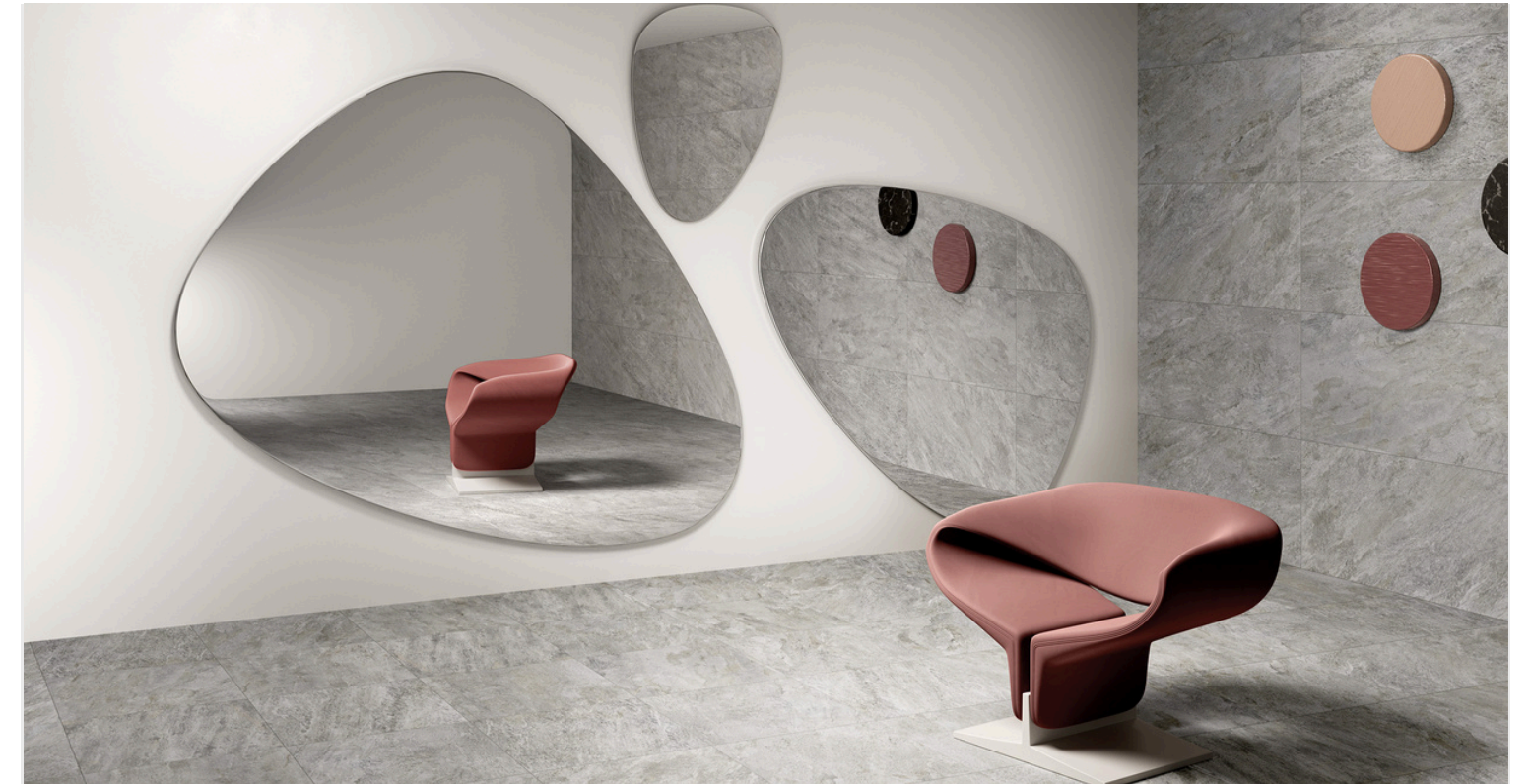
G8728 Giorbello Quarzia Grey 60x60 / 23,6"x23,6"