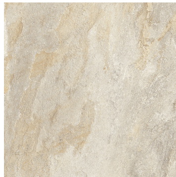
G8727 Giorbello Quarzia Gold 60x60 / 23,6"x23,6"