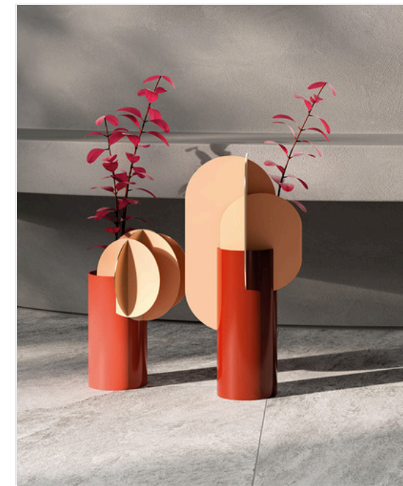
G8728 Giorbello Quarzia Grey 60x60 / 23,6"x23,6"