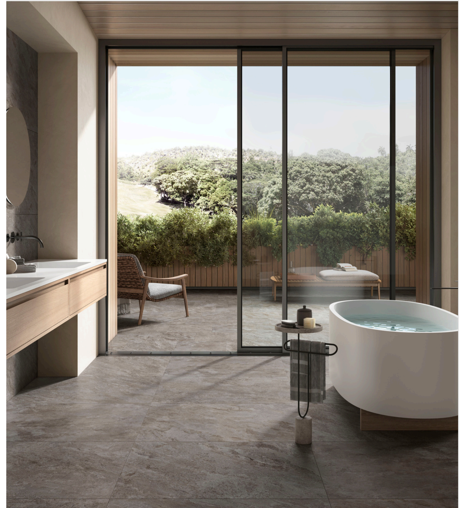
G8729 Giorbello Quarzia Black 60x60 / 23,6"x23,6"