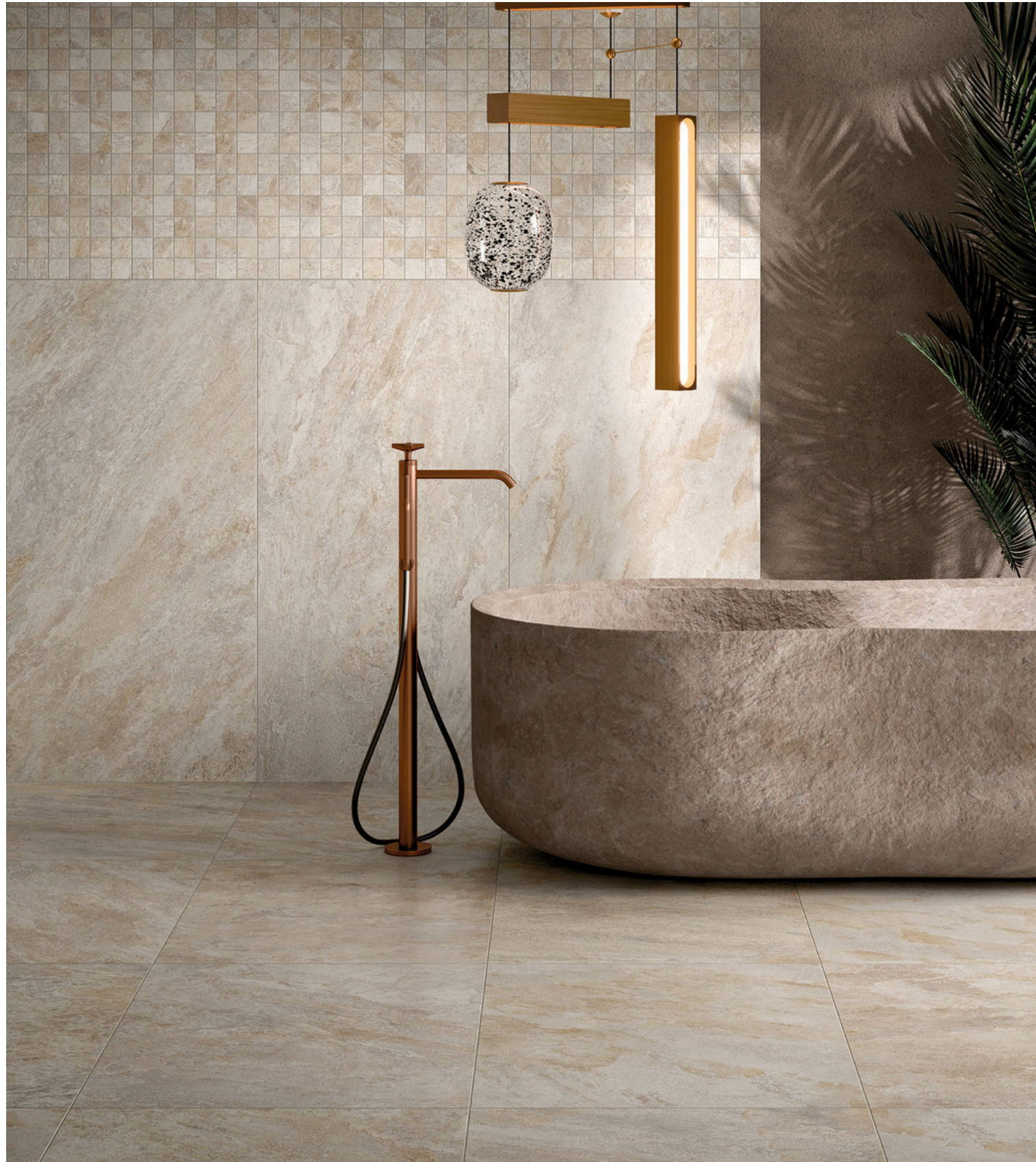
G8726 Giorbello Quarzia White 60x60 / 23,6"x23,6"