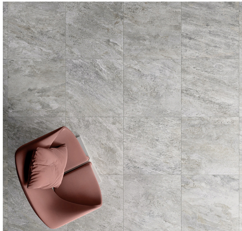
G8728 Giorbello Quarzia Grey 60x60 / 23,6"x23,6"