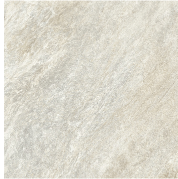
G8726 Giorbello Quarzia White 60x60 / 23,6"x23,6"