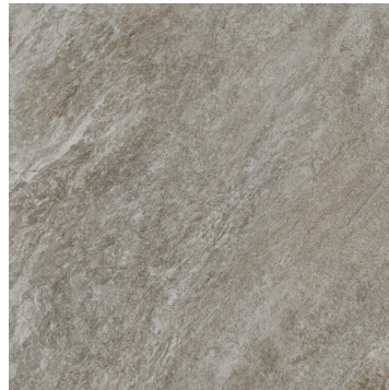
G8729 Giorbello Quarzia Black 60x60 / 23,6"x23,6"