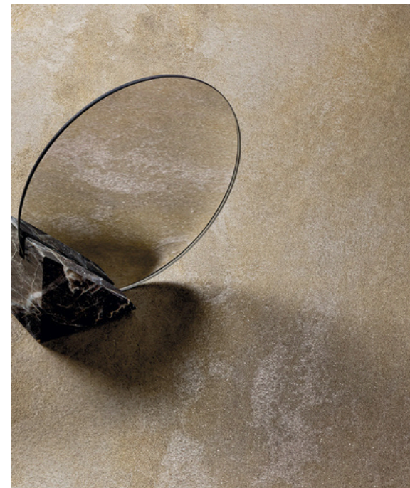
G8727 Giorbello Quarzia Gold 60x60 / 23,6"x23,6"