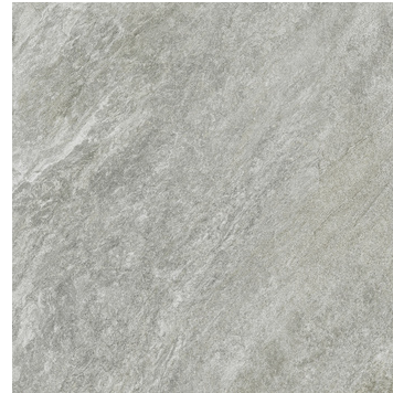
G8728 Giorbello Quarzia Grey 60x60 / 23,6"x23,6"