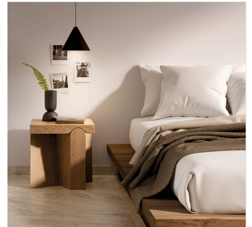
G8727 Giorbello Quarzia Gold 60x60 / 23,6"x23,6"