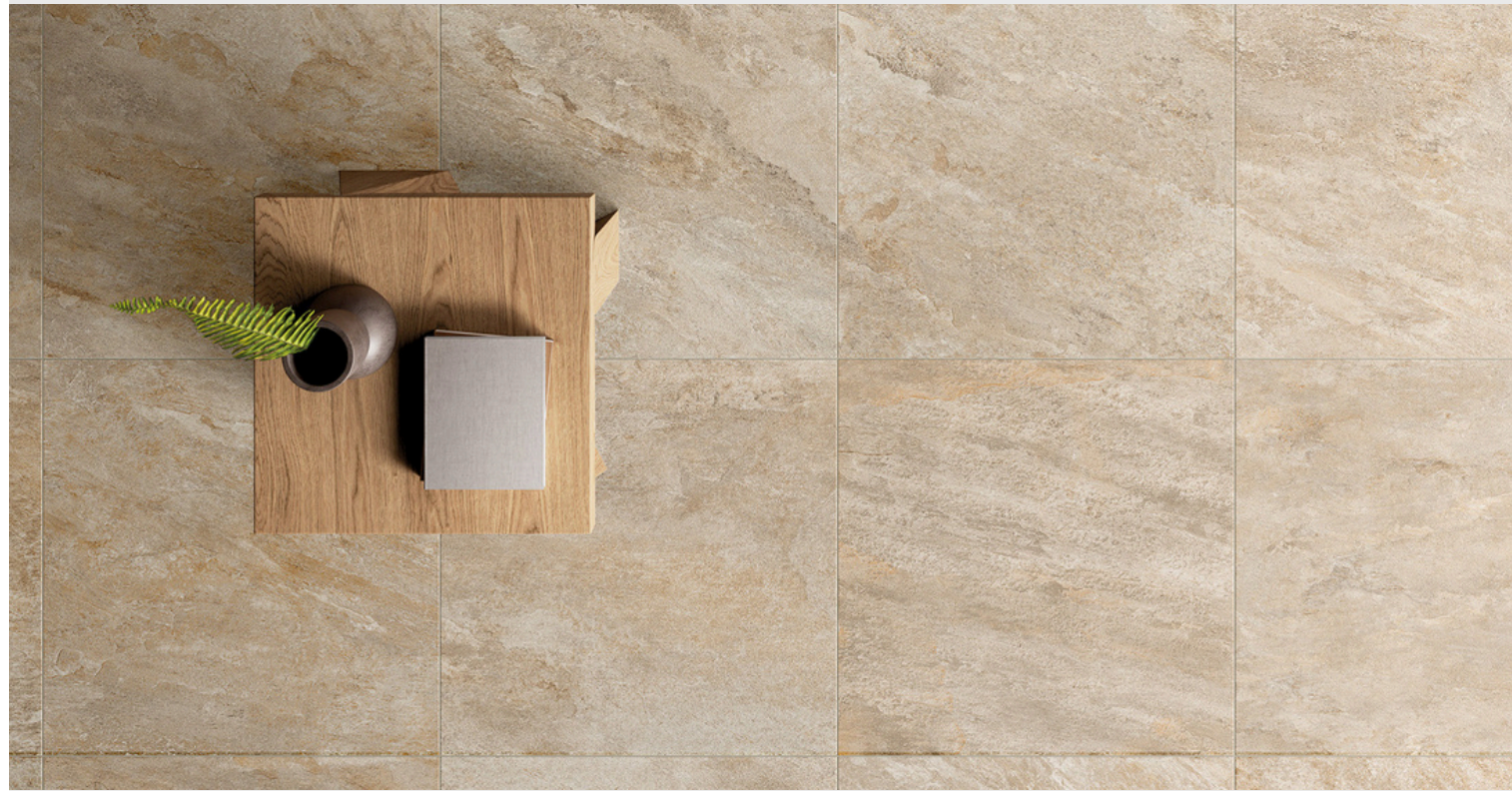
G8727 Giorbello Quarzia Gold 60x60 / 23,6"x23,6"