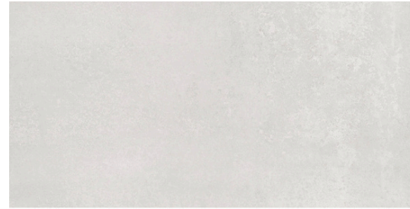
G8650 Giorbello Mélange White 32x62,5 / 12,6"x24,6"