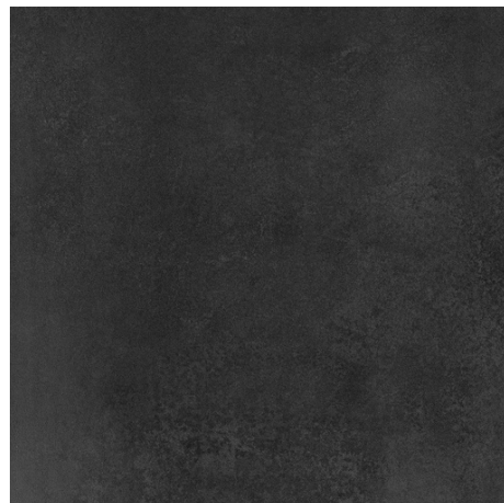
G8648 Giorbello Mélange Black 60x60 / 23,6"x23,6"