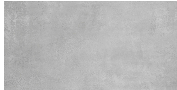
G8655 Giorbello Mélange Gray 32x62,5 / 12,6"x24,6"