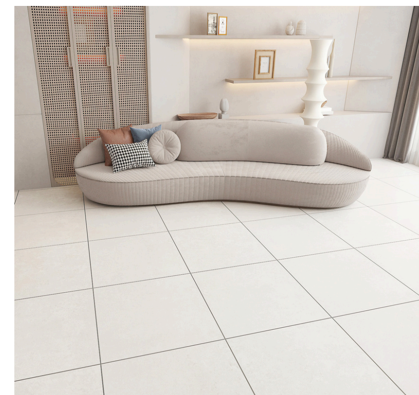
G8640 Giorbello Mélange White 60x60 / 23,6"x23,6"