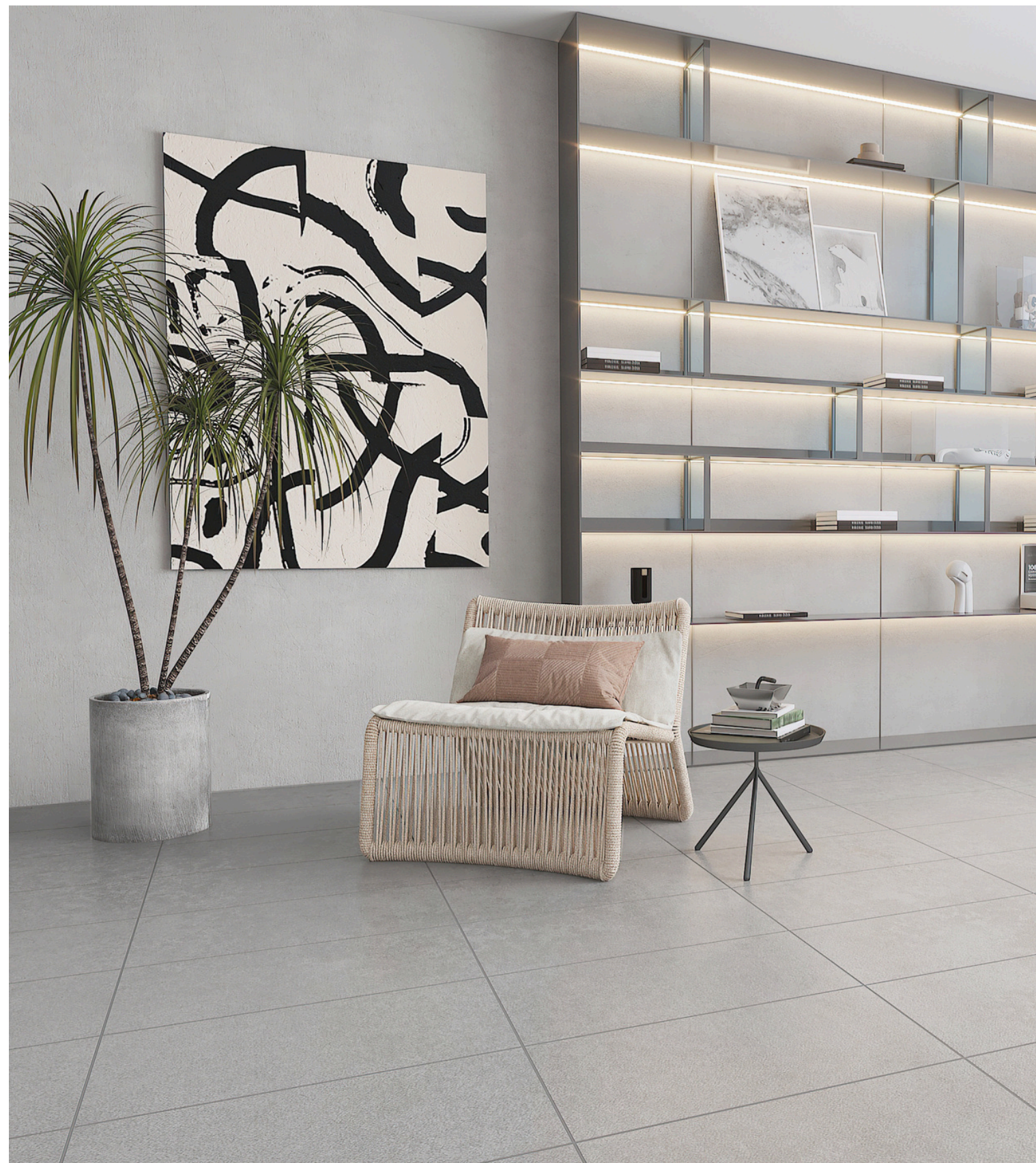
G8655 Giorbello Mélange Gray 32x62,5 / 12,6"x24,6"

60x60 cm / 23,6"x23,6" 32x62,5 cm / 12,6"x24,6"