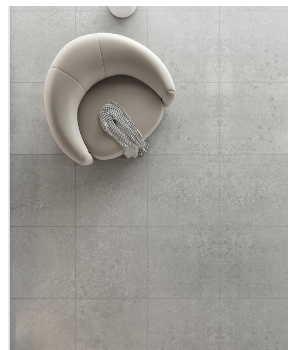
G8645 Giorbello Mélange Gray 60x60 / 23,6"x23,6"