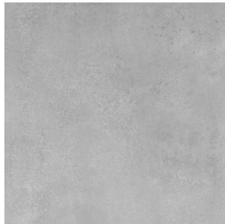
G8645 Giorbello Mélange Gray 60x60 / 23,6"x23,6"