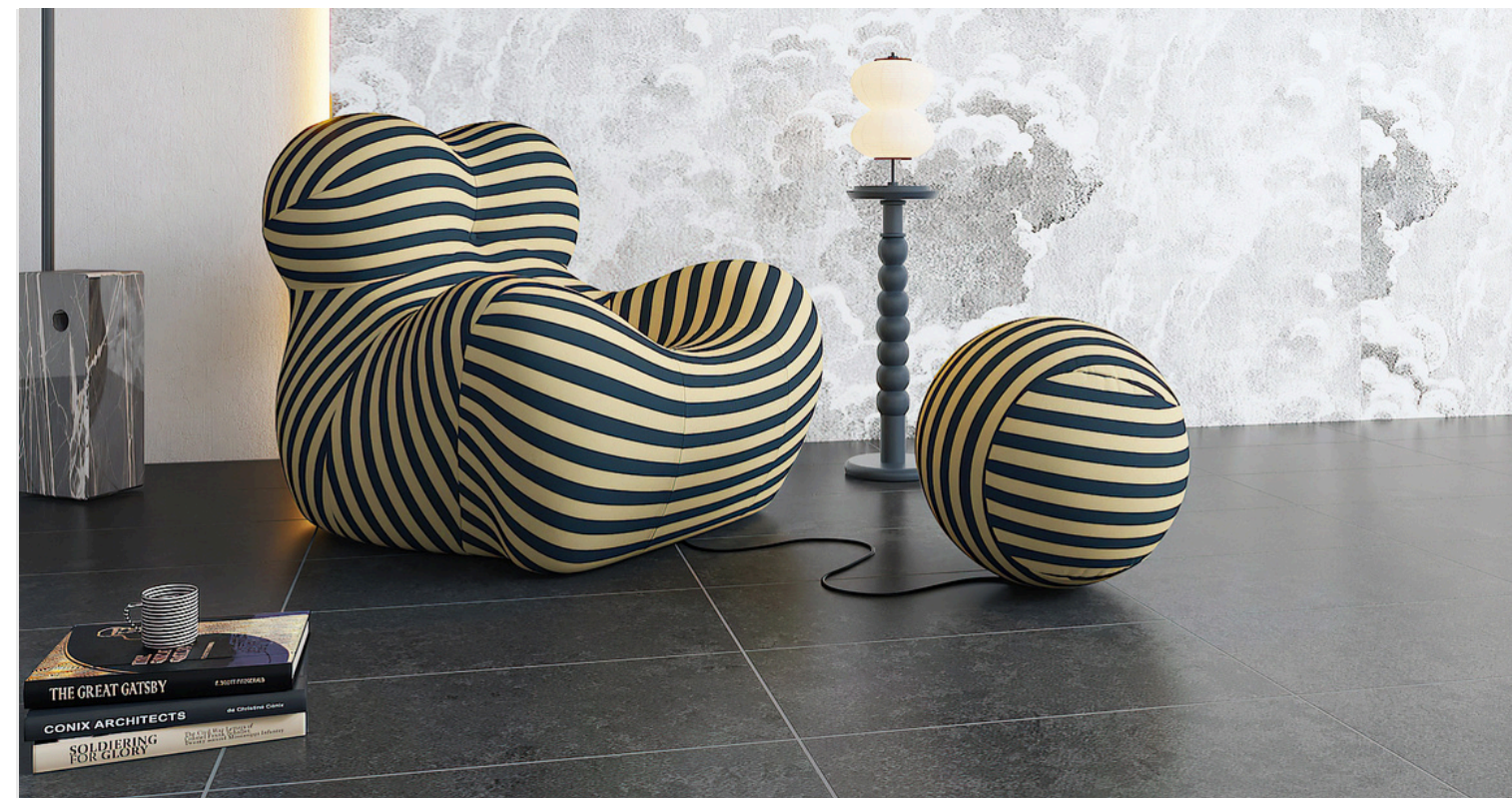
G8658 Giorbello Mélange Black 32x62,5 / 12,6"x24,6"