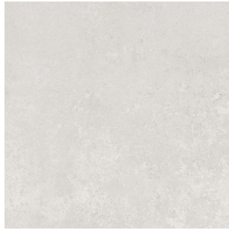
G8640 Giorbello Mélange White 60x60 / 23,6"x23,6"

60x60 cm / 23,6"x23,6" 32x62,5 cm / 12,6"x24,6"