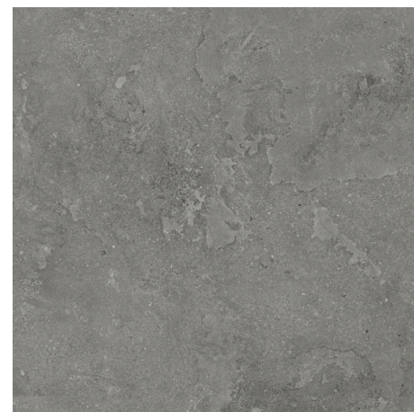
D8935 EcoStone Black 120x120 / 48"x48"