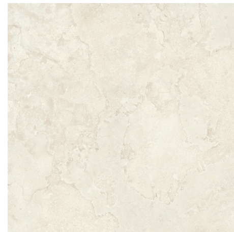
D8933 EcoStone Ivory 120x120 / 48"x48"