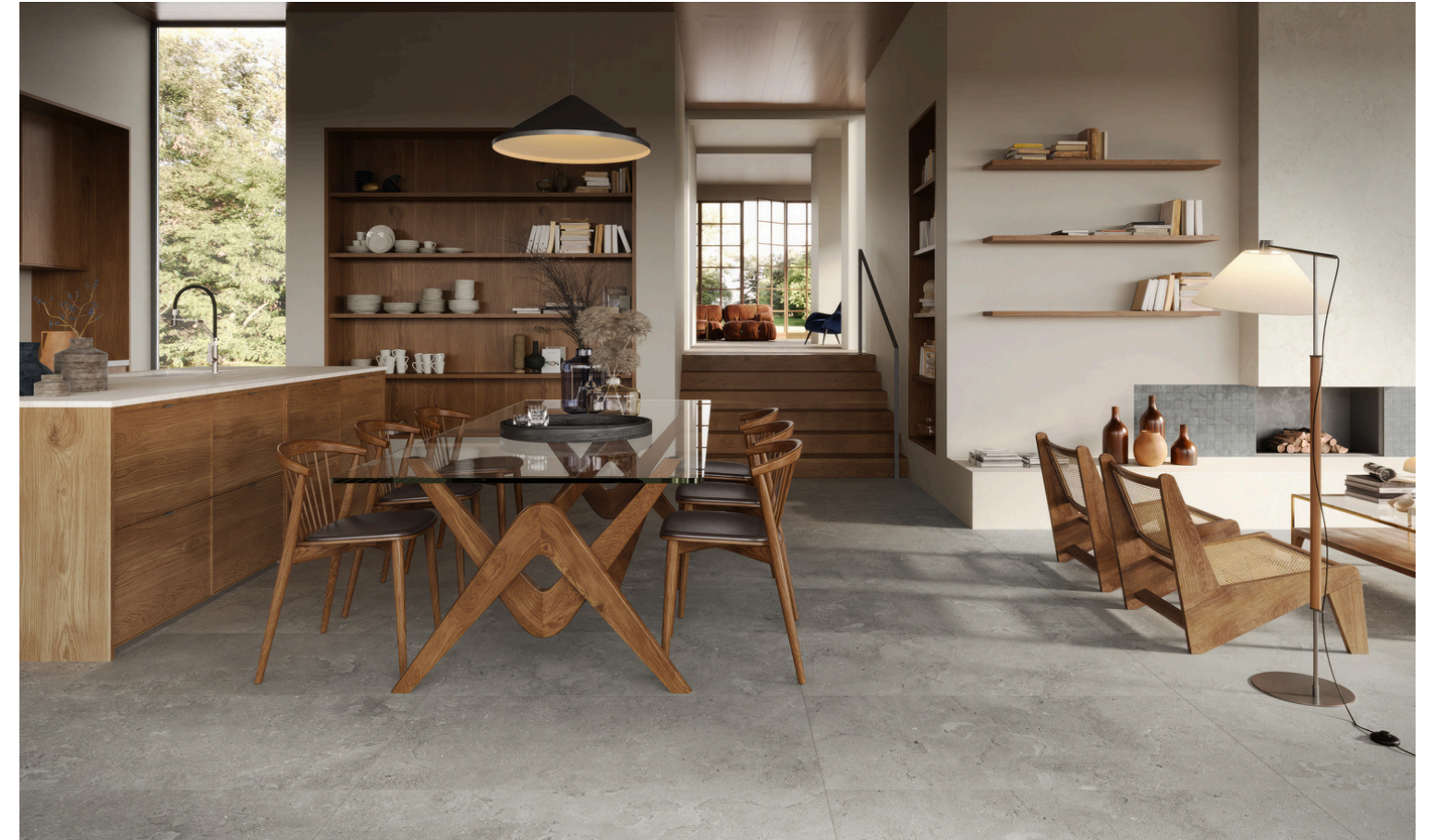
D8930 EcoStone Gray 60x120 / 24"x48"