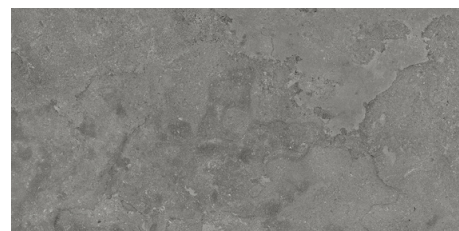
D8934 EcoStone Black 60x120 / 24"x48"