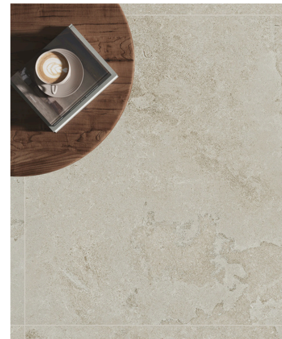
D8931 EcoStone Gray 120x120 / 48"x48"