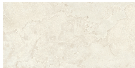
D8932 EcoStone Ivory 60x120 / 24"x48"