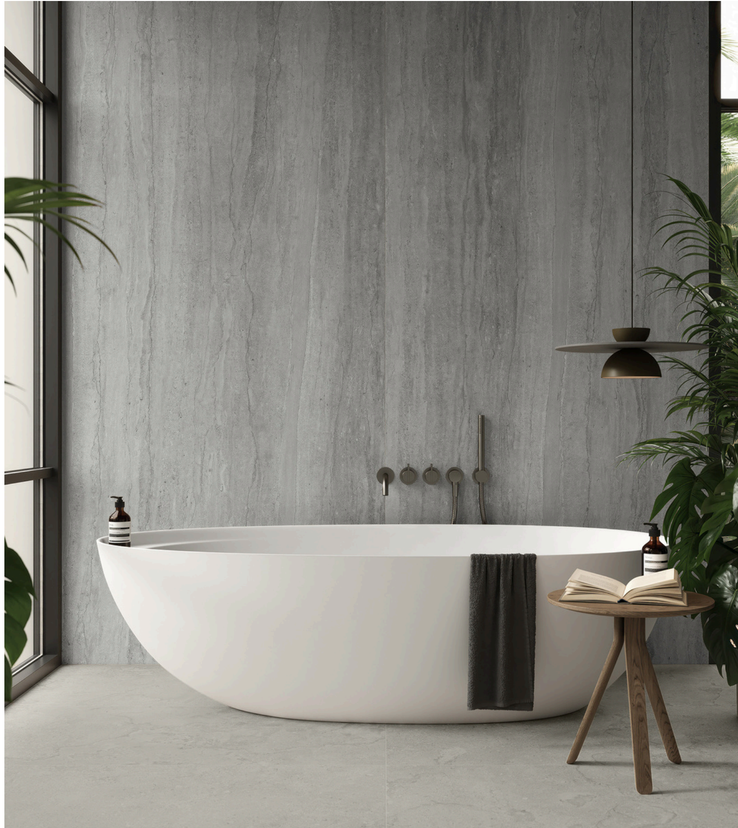
D8932 EcoStone Ivory 60x120 / 24"x48"

60x120 cm / 24"x48" 120x120 cm / 48"x48"