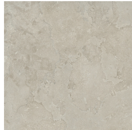
D8931 EcoStone Gray 120x120 / 48"x48"