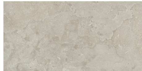
D8930 EcoStone Gray 60x120 / 24"x48"