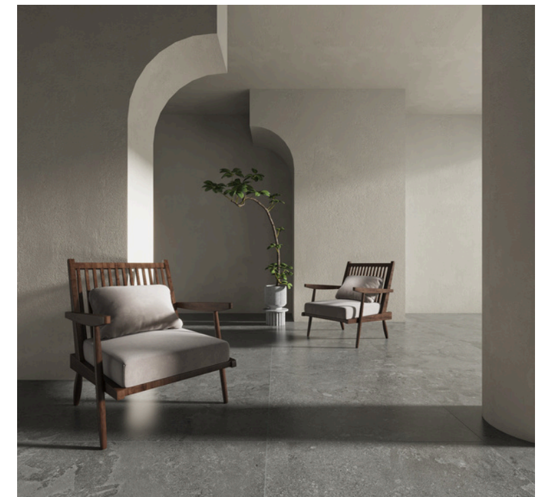
D8935 EcoStone Black 120x120 / 48"x48"