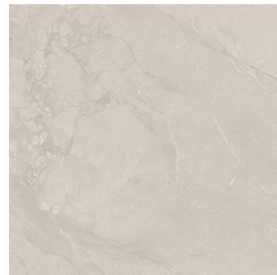
G8822 Callas Grey 60x60 cm / 23.62"x23.62"