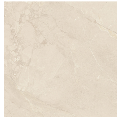
G8821 Callas Beige 60x60 cm / 23.62"x23.62"