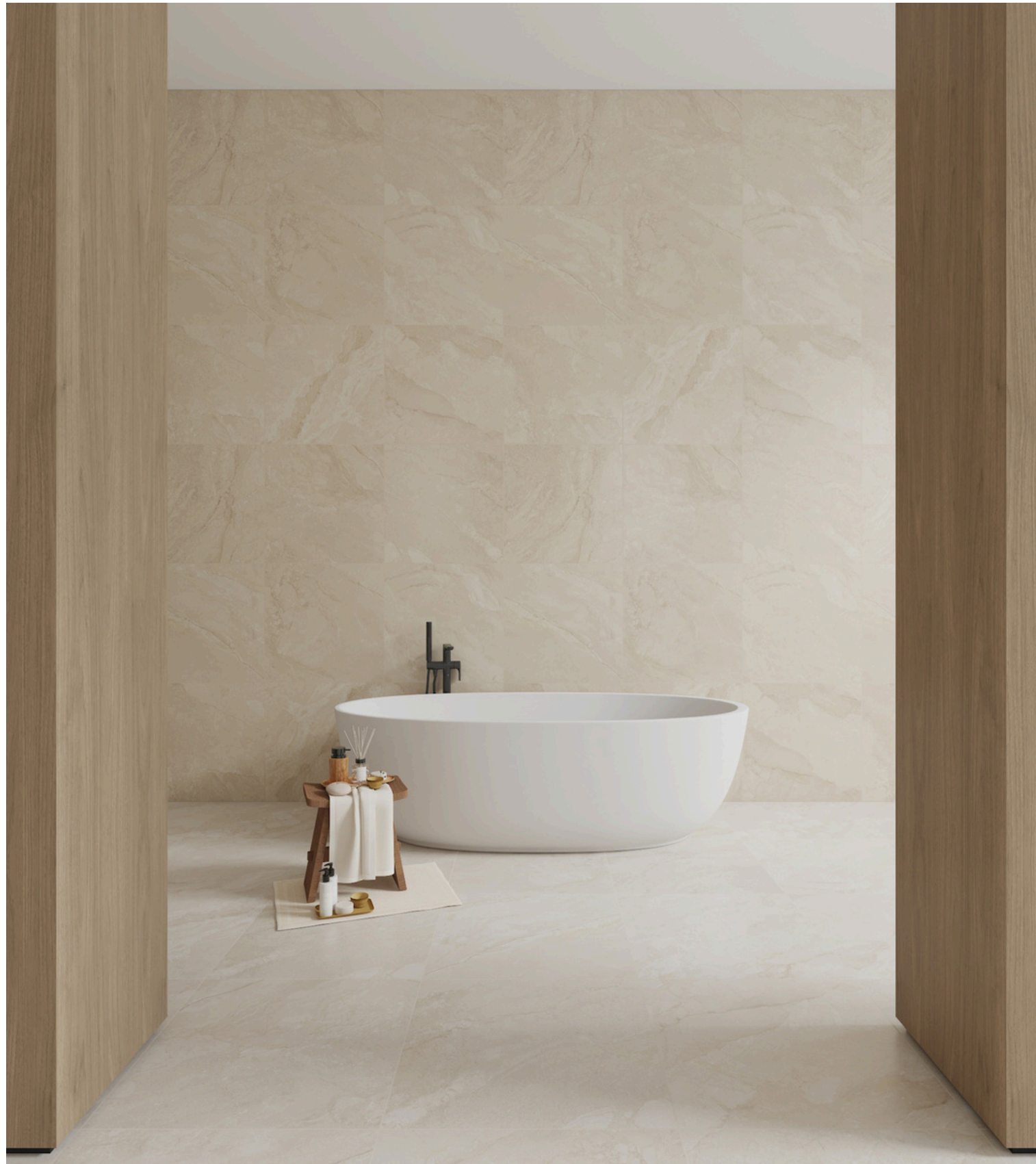
G8820 Callas Ivory 60x60 / 23.62"x23.62" - G8821 Callas Beige 60x60 / 23.62"x23.62"