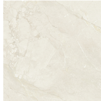
G8820 Callas Ivory 60x60 cm / 23.62"x23.62"